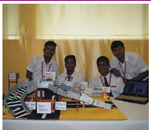
national science exhibition