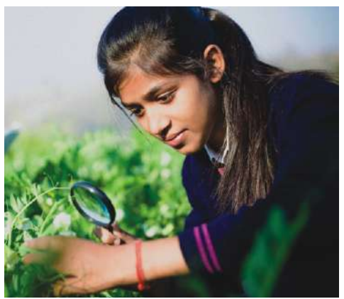
organic integrated learning