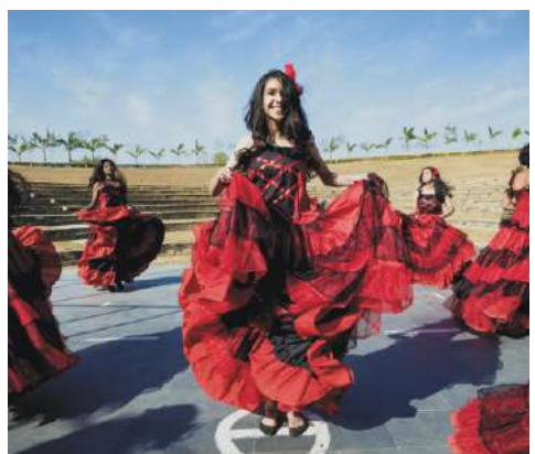
music & dance