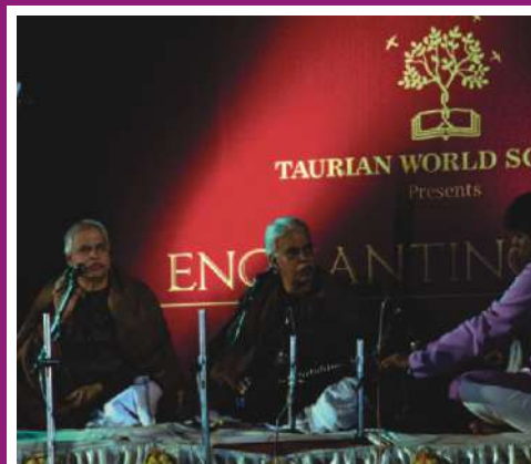
Pandit Ranaj Mishra & Sajan Mishra