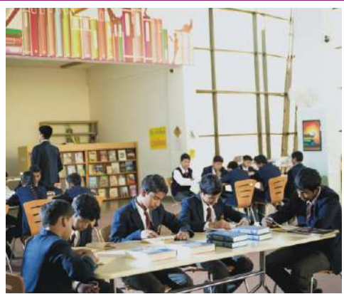
well equipped library