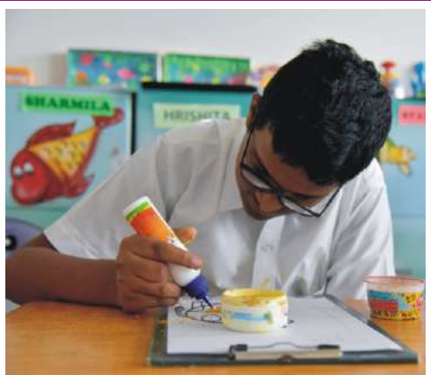
progressive learning centre