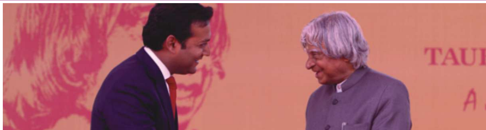
Dr. A.P.J. Abdul Kalam