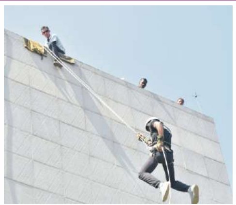
in house adventure camp