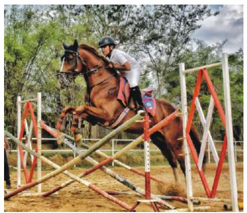
taurian equestrian centre