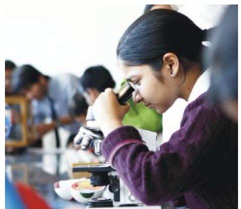
fully equipped lab