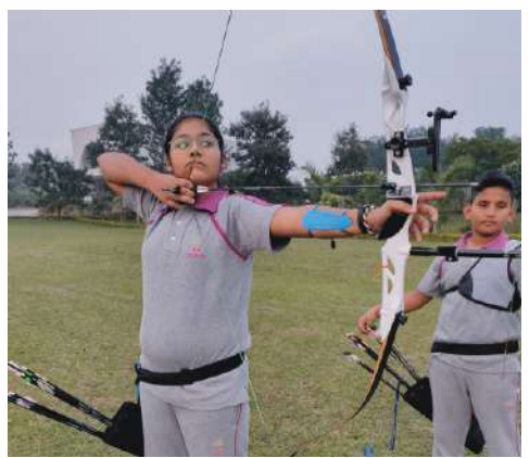
taurian archery centre