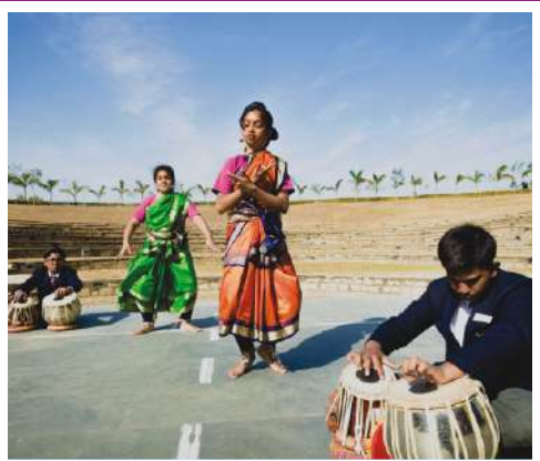
music & dance